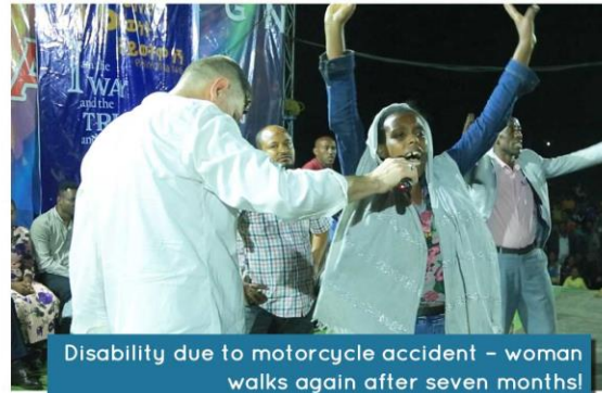
Disability due to motorcycle accident - woman walks again after seven months!