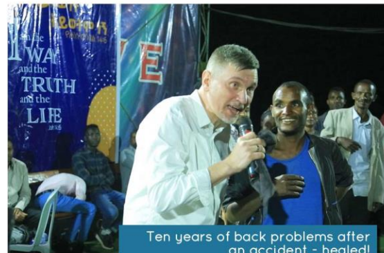
Ten years of back problems after an accident - healed!